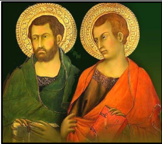
SAINT SIMON AND SAINT JUDE

How do you feel when you are chosen to do something important? Honored, surprised, nervous? Some of the apostles must have felt as you do.